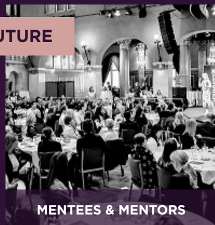
MENTEES & MENTORS

We share our tools and give you the inspiration for a successful and progressive mentorship. You will be able to challenge your questions and goals for the program. We also discuss reversed mentorship and how we can use the expertise, experience and perspectives that different generations can contribute to each other. You receive valuable insights on how you can lead different generations today and in the future.