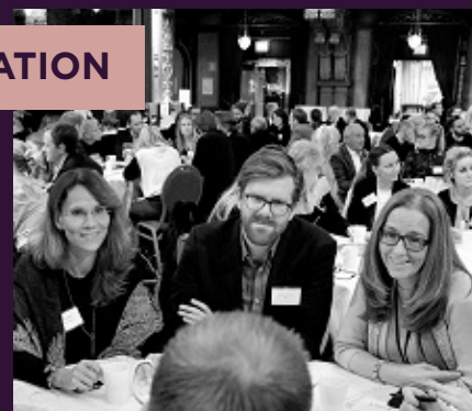
MENTEES & MENTORS

We open our perspective to understand how we should navigate as leaders in a future organization. Which trends affect us? What is the new way of working and how can our organization develop our sustainable innovation? Innovative companies and leaders are there to guide us in these questions. You are a part of the discussion and will collect many new ideas to bring back to your organization and team.