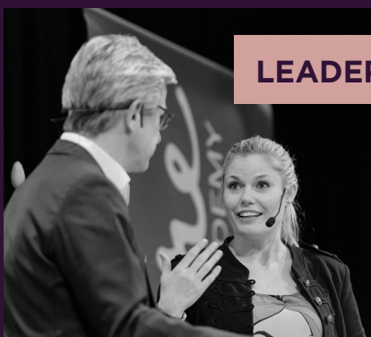
MENTEES & MENTORS

We invite some of Sweden's most influential leaders and organizations for an interactive workshop with focus on future leadership. We discuss which values and routines that form today's organizations and how we approach them in the best way. You will discover how you can make a difference in your leadership and be inspired with new ideas to incorporate in your dialouge with your mentor.